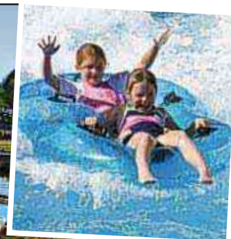
Super slides: The new Center Parcs at Woburn Forest near Milton Keynes